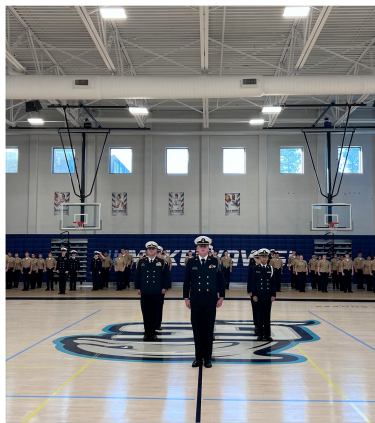
NJROTC held their annual Navy inspection. The cadets performed at a very high level and passed the inspection with flying colors. The inspection included a uniform inspection, drill performance, awards ceremony, and a staff briefing with the inspector.