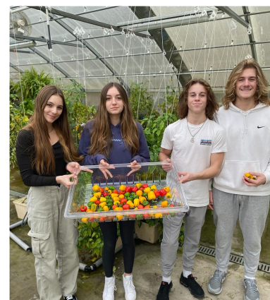
Students harvested their first batch of bell peppers. The bell peppers went to the school cafeteria for a taco fiesta salad.